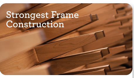
Superior frame design is quality engineered for lasting durability.