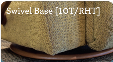
Swivel Base [10T/RHT]

Enjoy the best of both worlds. Full-reclining comfort and 360° swivel motion.