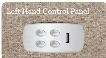
Left Hand Control Panel

Changes location of standard 4-button mounted controller from right-side to left-side sitting.