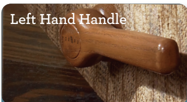
Left Hand Handle

Changes location of standard right-side handle to left-side sitting.